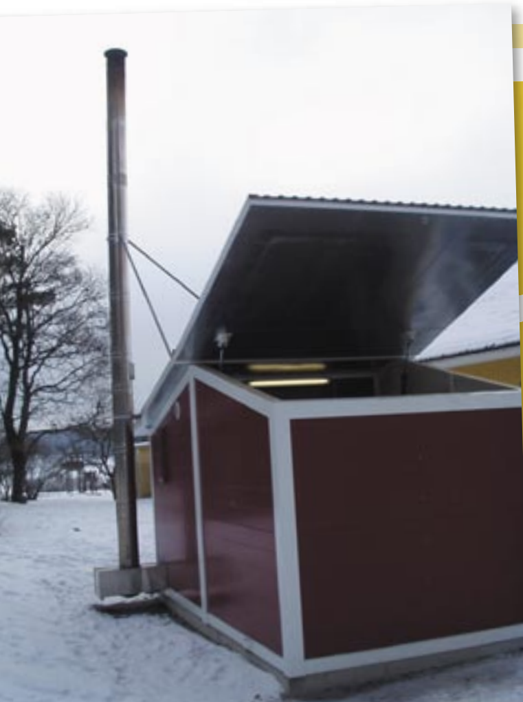
Heating plant for biomass.