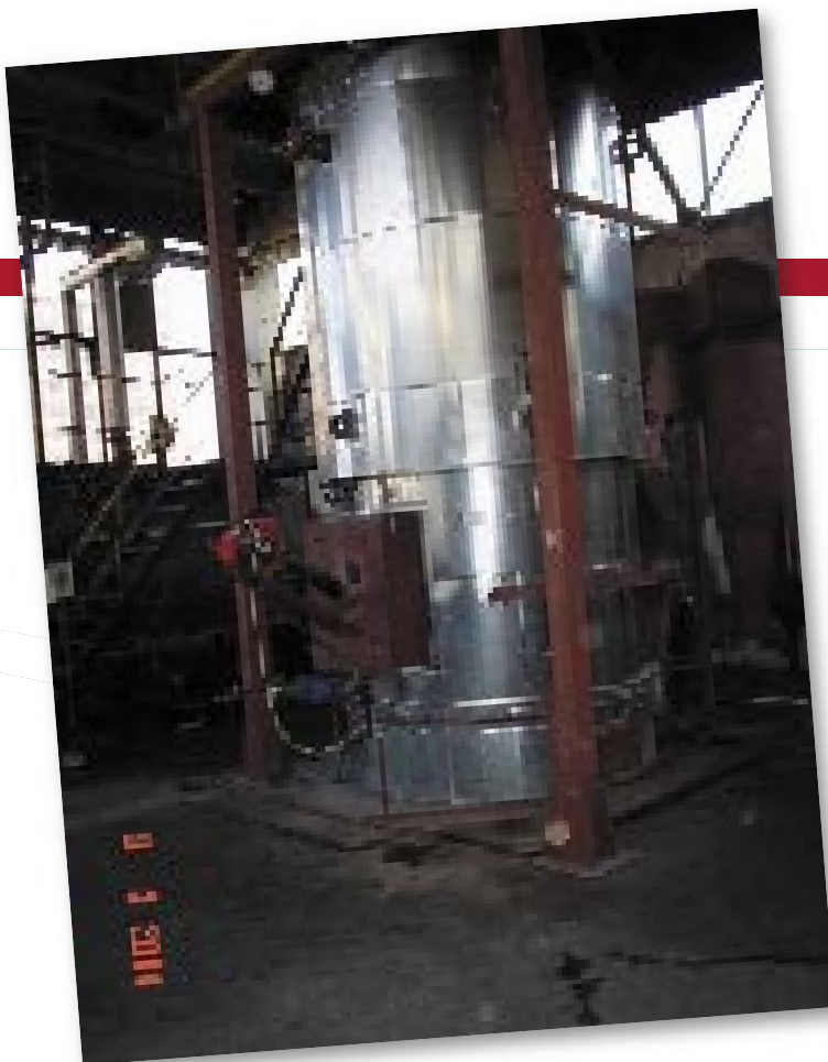
The boiler on wood briquettes.