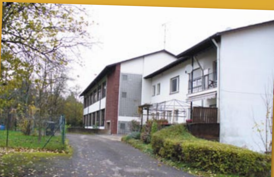
Buildings in the municipality of Losheim using biomass for heating.