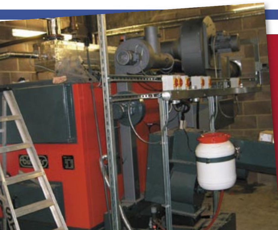
300 kW wood chip boiler.