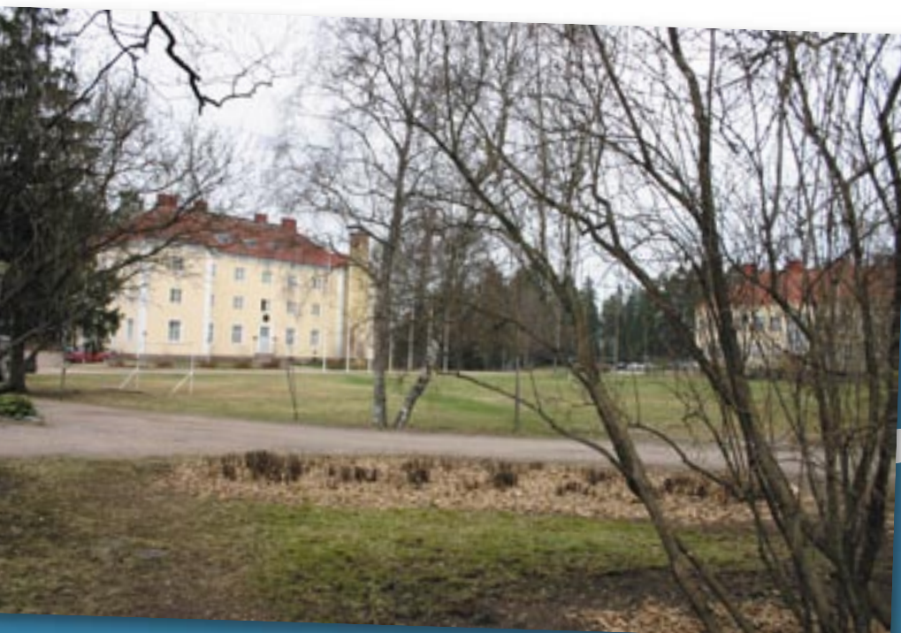
Picture of the Ryttylä Training center.