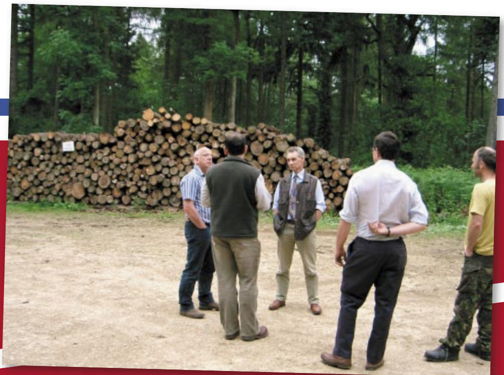
Members of the Gloucestershire Wood Fuels.