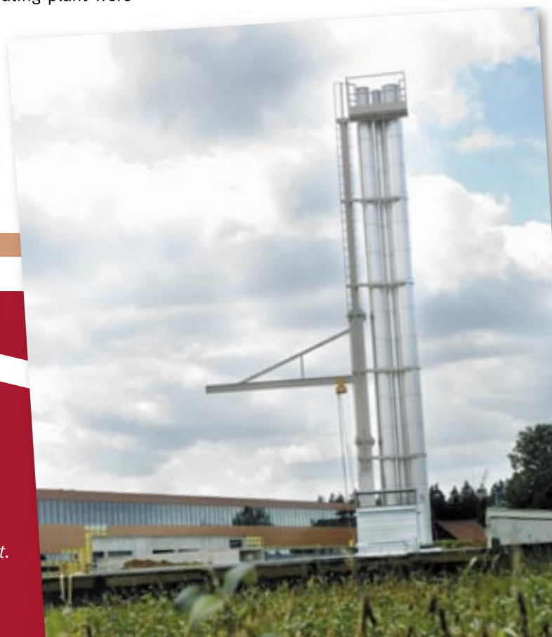
Pipes from a biomass heating plant.