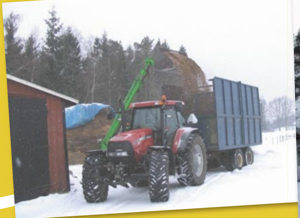
Loading and delivery of wood chips.