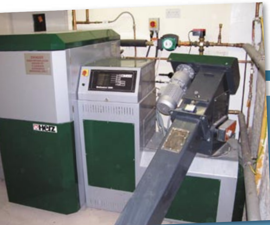
A 50 kW wood boiler using pellets as fuel.