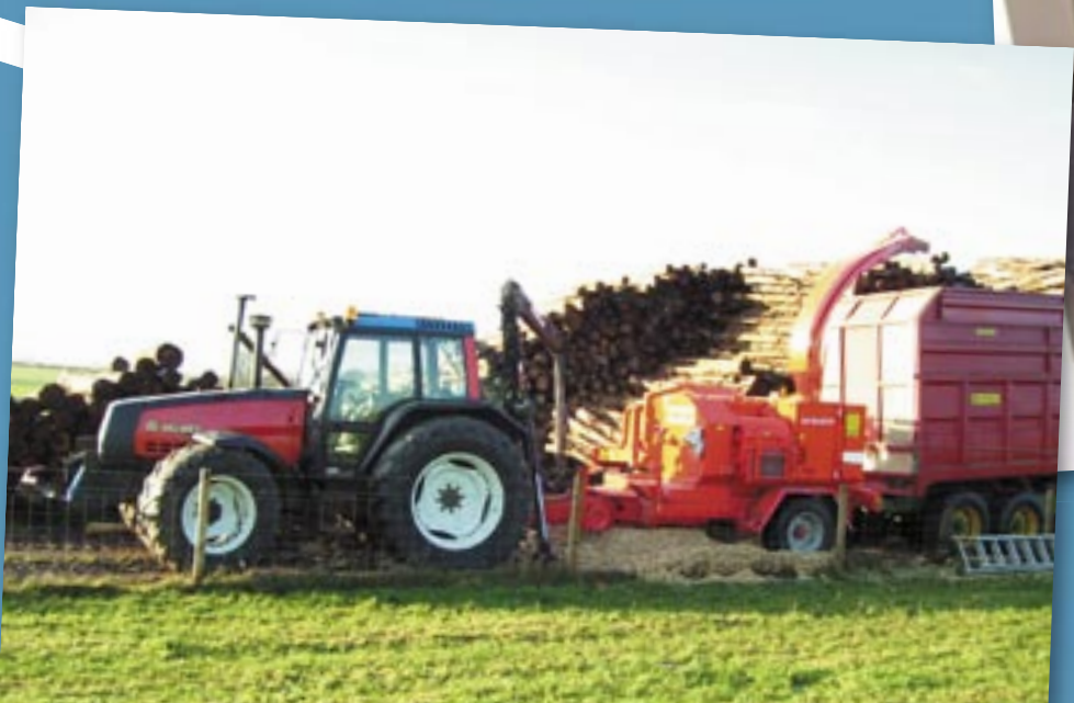
A wood-fuel chipping machine