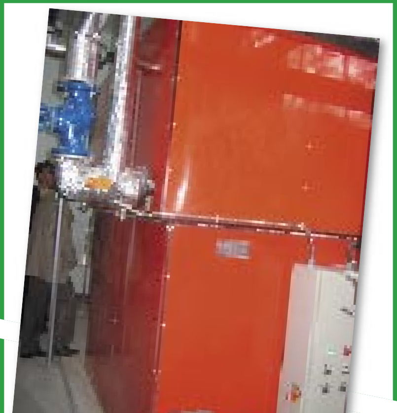
Boiler on wood chps